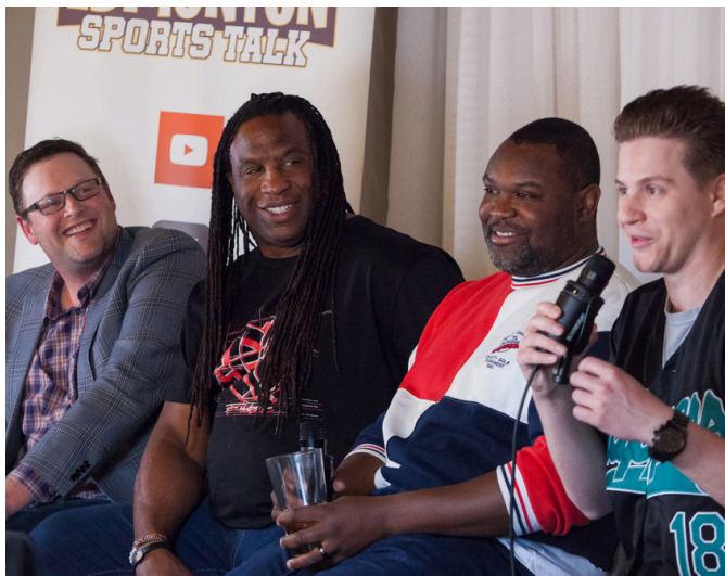
Edmonton Sports Talk Bids for Kids included former Oiler Georges Laraque

Join us for Edmonton's biggest pizza party and celebrate a milestone with KidSport Edmonton, of 30 years of impact in the local community! Enjoy a casual night with friends while you chow down on a massive pizza buffet with unlimited slices from pizzerias that donate their dough to help KidSport raise some dough. You'll have the opportunity to vote for your favorite pizza, as pizzerias compete for The People's Choice Awards. There's plenty of ways to engage from being a Corporate Partner to purchasing tickets and bringing a group of friends to the event. And when you're there, you'll have the chance to support the Fill the Net donation board, purchase a 50/50 ticket, and try your luck at the famous Pizza Box Raffle!